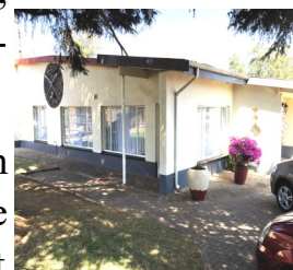
The lounge and dining room at the cottages.

I hope that you will enjoy reading the Cottages Chronicles.