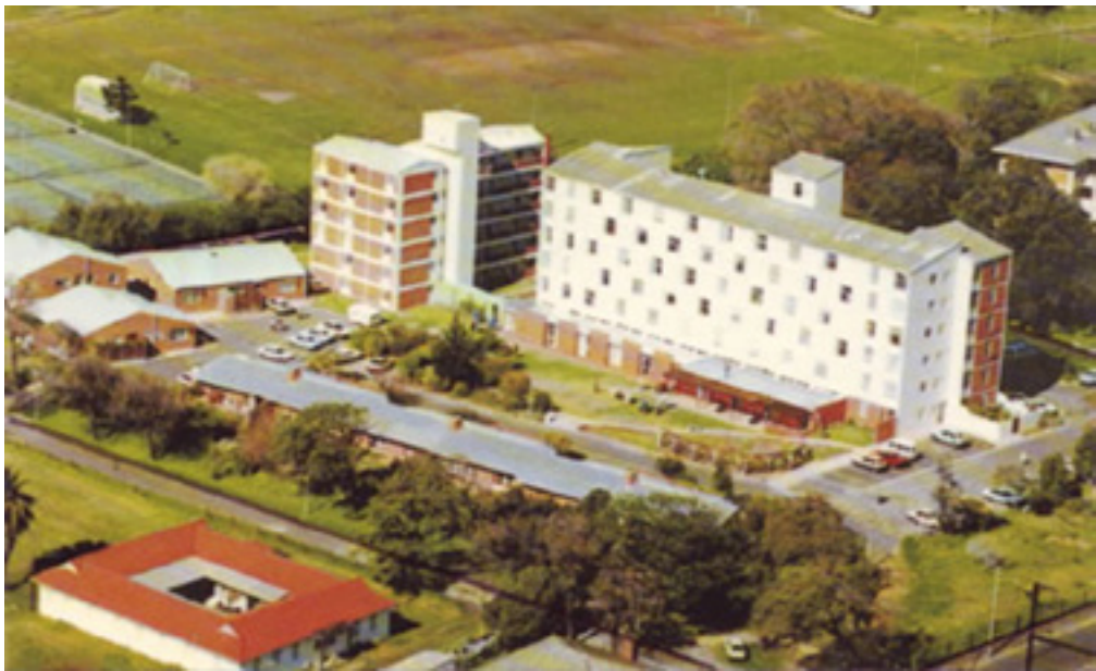
ROSEDALE SERVICE CENTRE: In case you can't remember where we meet, this is the place.