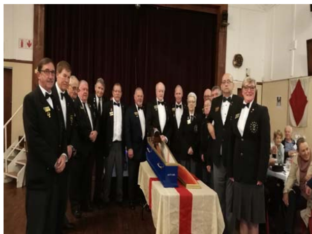
Dawn Patrol Shellhole