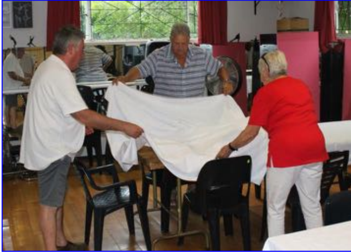
Setting the tables