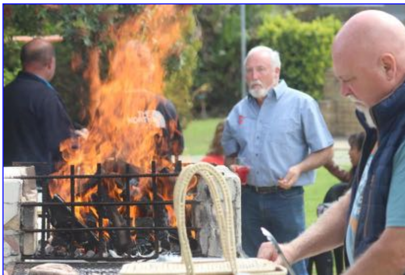
Boys will be boys