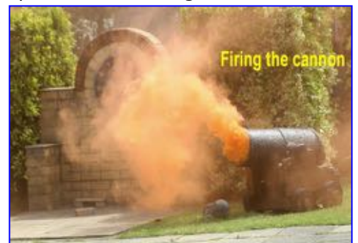
Firing the cannon

Later that afternoon Someone fired The cannon