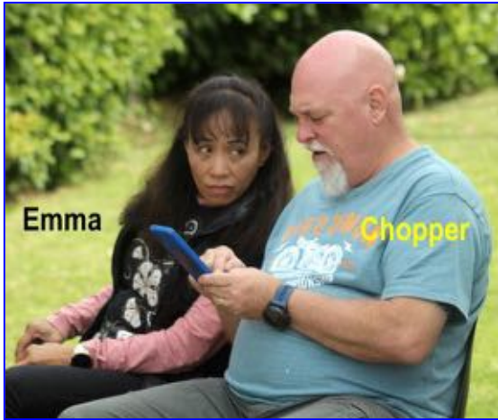
Who's phoning me now!!